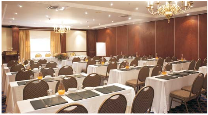
Our fully equipped conference facilities are situated in a separate building, in the hotel gardens. Facilities include seven meeting and conference rooms and the equipment necessary to turn your event into a success. We cater for banquets and cocktail parties.