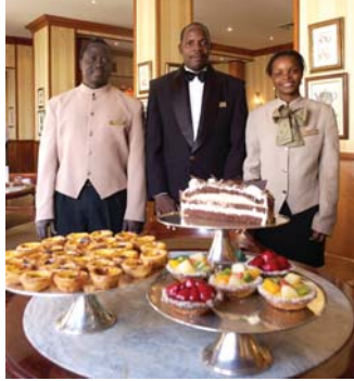
The Continental Coffee Shop offers an array of homemade pastries, coffees and light meals.