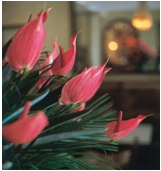
The foyer and lounge area allude to the Polana Serena Hotel's timeless distinction as guests are greeted in the inherently hospitable Mozambican manner.