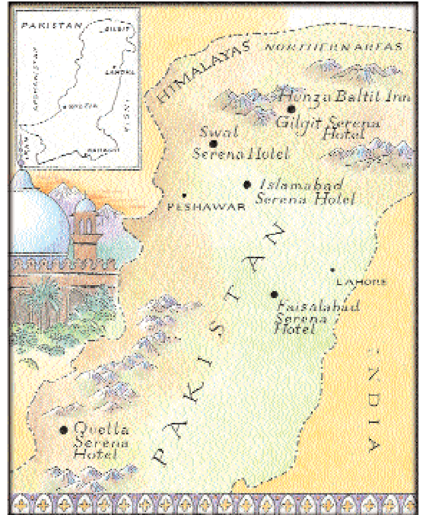
Illustration by Alan Cracknell