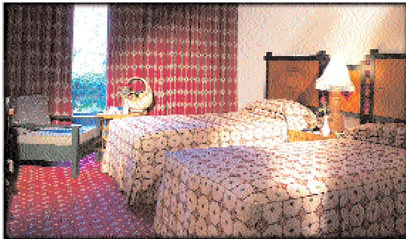
Rooms with stunning views

Only three kilometres from the legendary Silk Route, the Gilgit Serena Hotel stands at the foot of the Himalayan mountain range commanding breathtaking vistas of its snow-capped peaks and rugged landscape. The hotel has 43 elegantly furnished rooms with stunning views of Mount Rakaposhi and the Jutial Nala, and offers all luxurious modern comforts and amenities including air-conditioning and cable TV. The Dumani Restaurant serves Pakistani, Chinese and continental dishes and has a beautiful panoramic view over the Hunza River, Gilgit River and Danyore Valley. The Jutial Lounge serves light cooking throughout the day and in the evenings you can enjoy a barbecue by the campfire in the