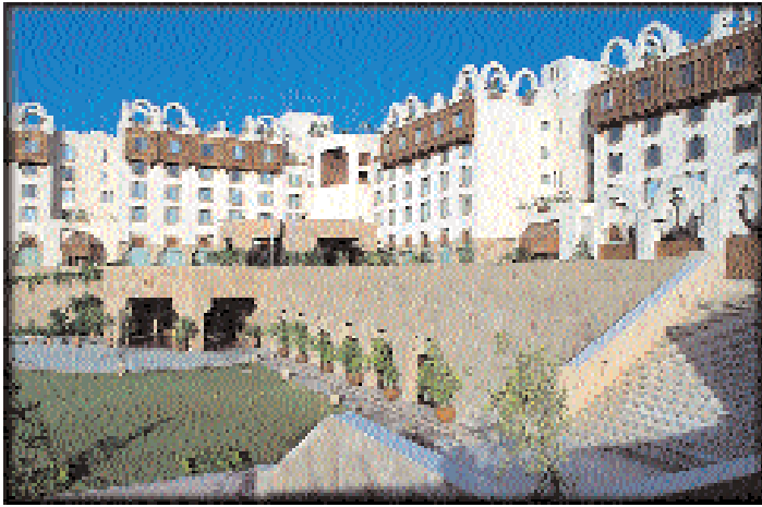
The impressive exterior

The Islamabad Serena Hotel stands at the foot of the Northern Hills in six acres of landscaped gardens in the centre of Islamabad, the capital of Pakistan. The Moorish and Mughal architecture and interiors of this exceptional hotel reflect the expression and cultural heritage of the local craftsmen who built it. Developed to the highest standards using indigenous materials such as hand-hewn marble, hand-woven fabrics and individually painted wooden ceiling panels, the hotel beautifully combines tradition with the latest modern technology. The 197 rooms and suites have a distinct Punjabi and Swati style with magnificent views of the Margalla Hills and Rawal Lake. All have air-conditioning, internet access and flat screen televisions.