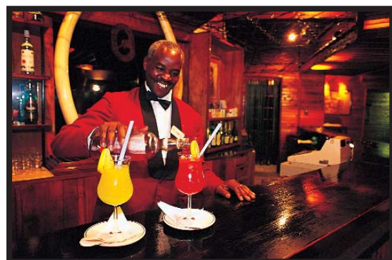
Service with a smile