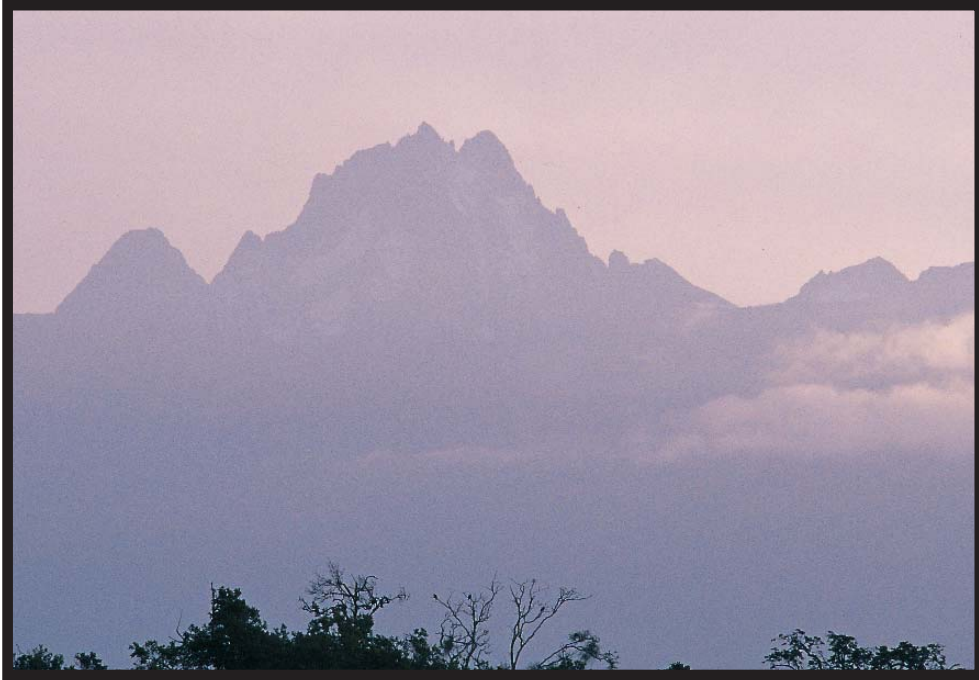
Views of Mt. Kenya

Located at 2,194 metres on the slopes of Mount Kenya, Serena Mountain Lodge is surrounded by a dense rainforest that comes alive at dusk with a myriad of sounds that make the African bush so special and exhilarating.