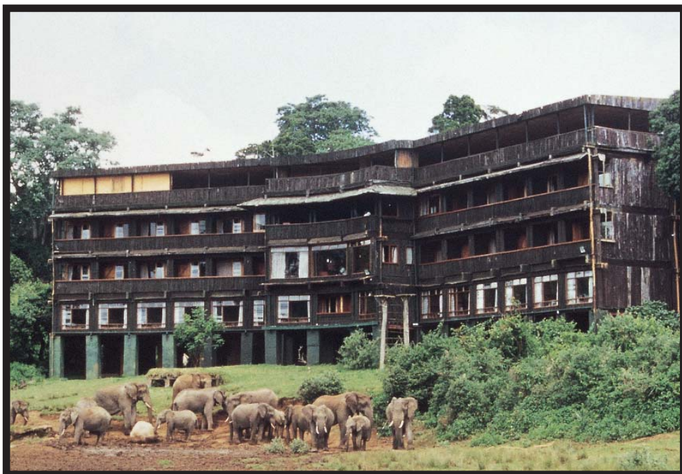
Animals at the waterhole

Considered the most spectacular forest waterhole in the Aberdares, the lodge's waterhole presents a constant ballet of wildlife.