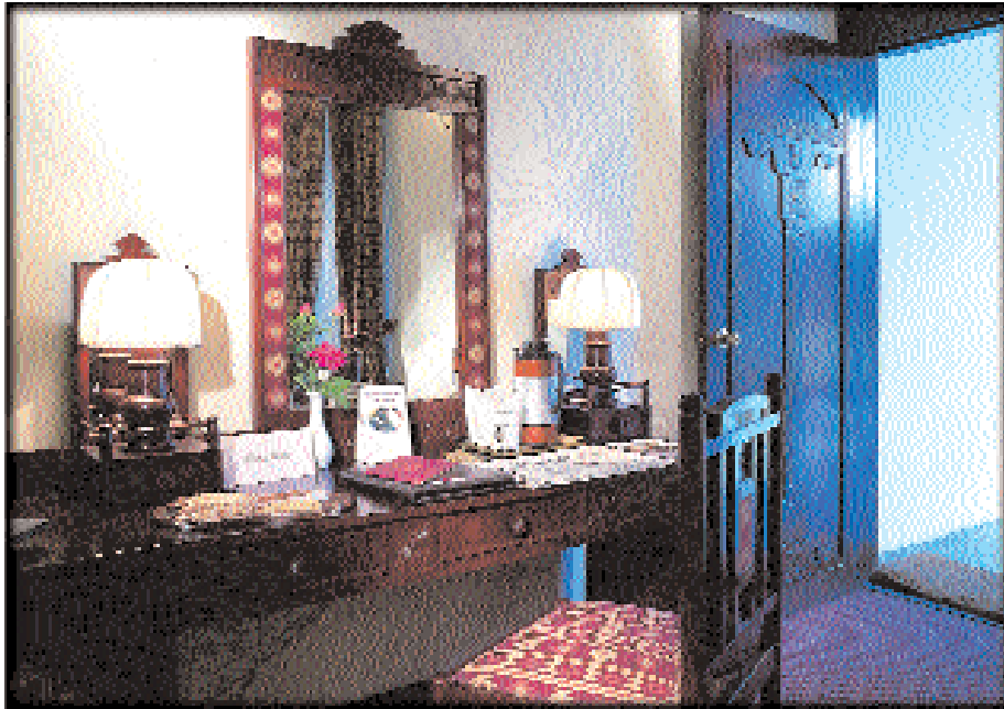
Colonial style combined with Art Deco

The Swat Serena Hotel is set in six acres of beautiful gardens in Saidu Sharif in the lush Swat Valley. Located at the foot of the Hindukush Mountains in the North West Frontier Province the hotel is a magnificent combination of colonial and Art Déco architecture with wide verandas and magnificent views of the rose gardens and mountains. It is within walking distance of the town of Mingora and offers all modern facilities and the best levels of service. Traditional and continental dishes are served in the Suvastu Restaurant, and the Wali Lounge serves drinks throughout the day. During the summer months, you may enjoy a delicious barbecue outside in the gardens. Leisure facilities include badminton, a table tennis room and an outdoor pool. Golf can be arranged on a nearby course.