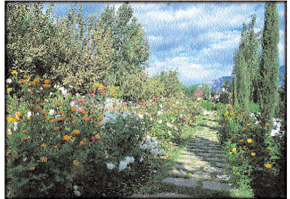
The rose gardens

Fishing, emerald-hunting and camping tours can be organised, accompanied by a professional guide. There are many places of interest in the area including two ski resorts and excellent walks at Madayan, Bahrain and Kalam. Marghazar, the famous white marble summer palace of the former Wali (King) of Swat, is well worth a visit.