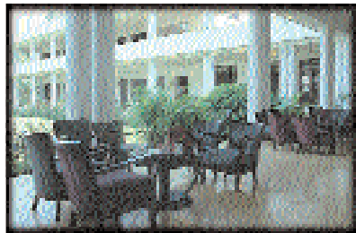
A drink on the verandah

The Swat Serena Hotel is set in six acres of beautiful gardens in Saidu Sharif in the lush Swat Valley. Located at the foot of the Hindukush Mountains in the North West Frontier Province the hotel is a magnificent combination of colonial and Art Déco architecture with wide verandas and magnificent views of the rose gardens and mountains. It is within walking distance of the town of Mingora and offers all modern facilities and the best levels of service. Traditional and continental dishes are served in the Suvastu Restaurant, and the Wali Lounge serves drinks throughout the day. During the summer months, you may enjoy a delicious barbecue outside in the gardens. Leisure facilities include badminton, a table tennis room and an outdoor pool. Golf can be arranged on a nearby course.